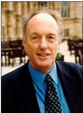
Dr Ian Gibson ~ GMB MP

There were mixed fortunes for the branch's motions and interests. We have returned to annual congresses: as expected, our motion was one of many calling for their reinstatement. Our motion calling for all guest speakers to be subject to questions from delegates was passed, though with a CEC qualification which called for flexibility. I am not sure where this leaves us exactly, but future delegates to Congress will have to challenge the suits if announcements are made to specify when the decision of Congress does not apply.